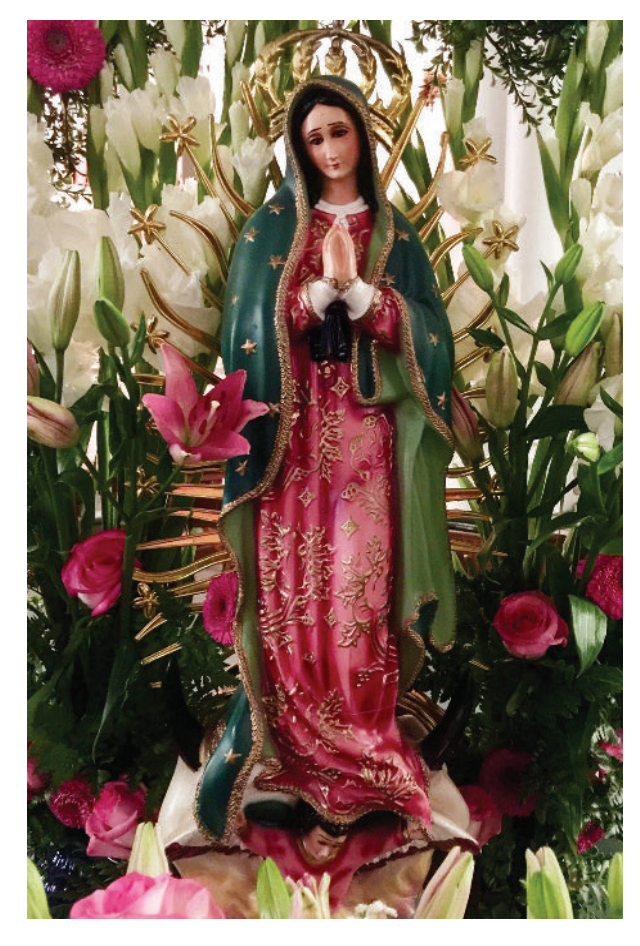
A statue of Our Lady of Guadalupe is seen at St. Joseph Parish in Bowling Green in December 2022.