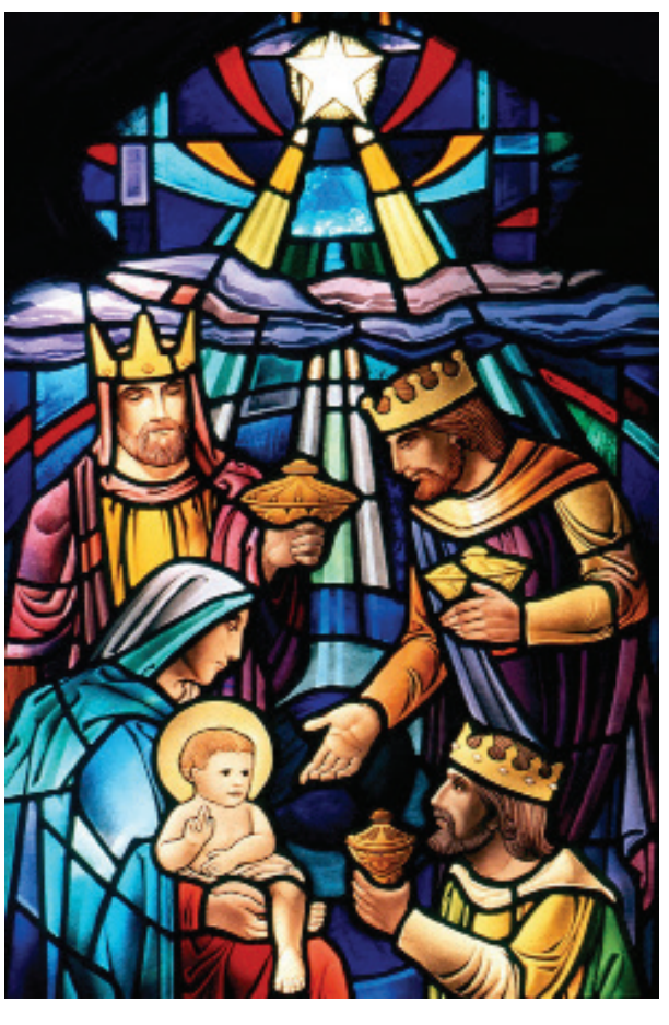
A church window depicts the visit of the Three Kings celebrated on the Feast of the Epiphany.

St. Nicholas of Myra's feast Dec. 6 is celebrated in many European countries as a day to share gifts ~ often candy, and often placed in shoes. As Europeans immigrated to the United States, various St. Nicholas traditions combined and emerged as Santa Claus. Sharing the story of the real St. Nicholas can help us emulate the generosity of his faith-filled life, which is in turn an expression