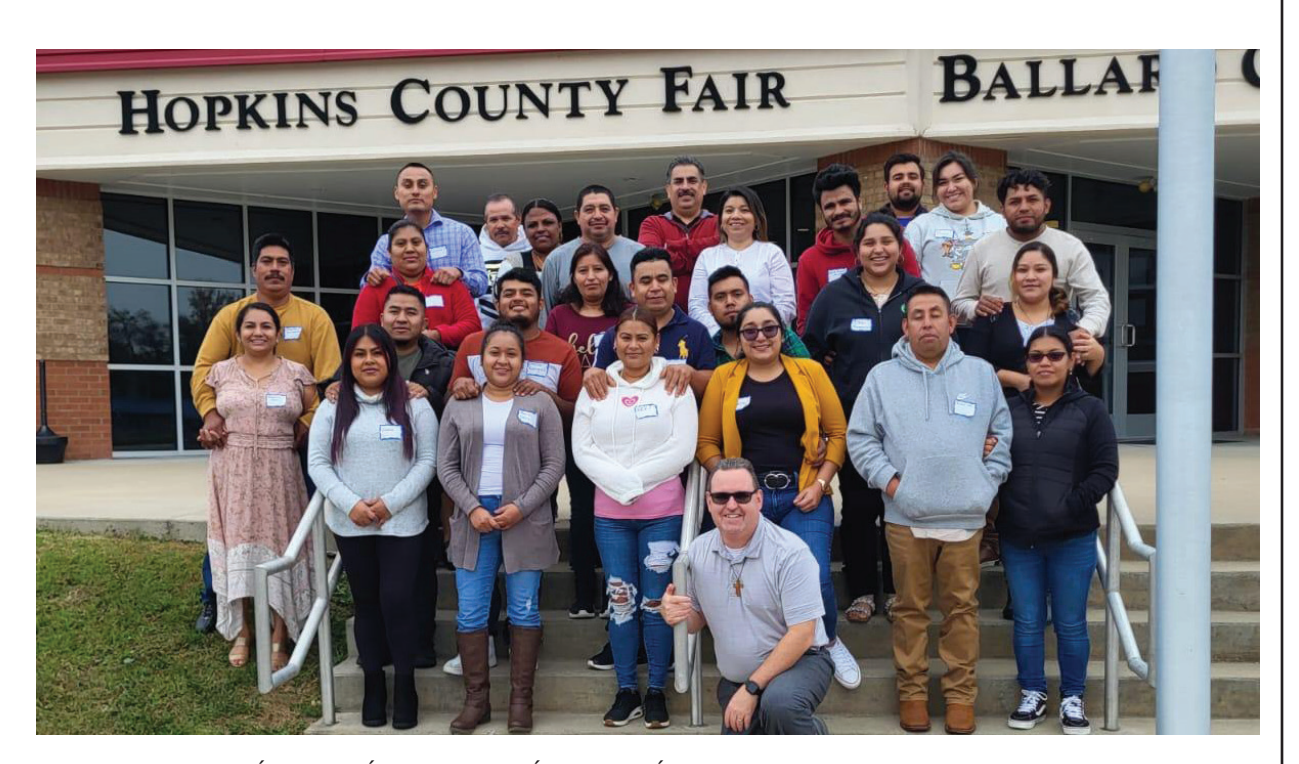
Las 13 parejas que participaron en el programa de preparación matrimonial Pre-Caña el 28 de octubre de 2023.

Por favor oren por todas las parejas que se preparan para el matrimonio y por todas las parejas casadas que su amor se fortalezca cada día. ■