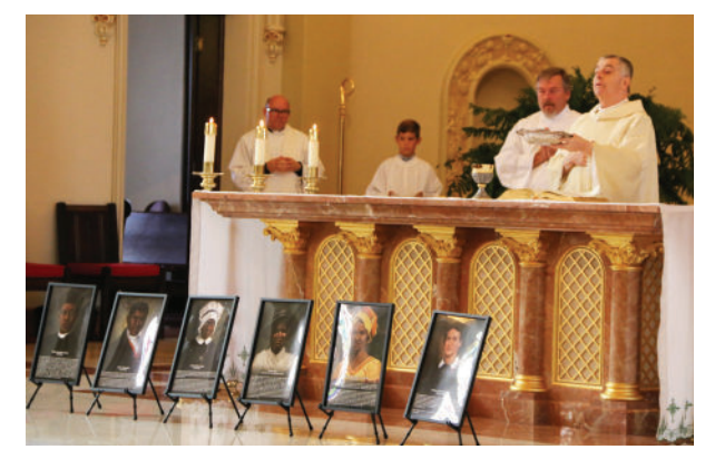
ELIZABETH WONG BARNSTEAD | WKC Bishop William F. Medley presides at the Nov. 4, 2023 Mass in celebration of Black Catholic History Month at St. Stephen Cathedral. Six framed portraits can be seen depicting the African American men and women whose causes for sainthood are currently open.

Music used in the liturgy included that of Clarence Joseph Rivers, a Black Catholic priest and famous composer of liturgical music – who paved the way for African American music to be used in the liturgy – and M. Roger Holland, II, another trailblazer in the legacy of African American Catholic music.