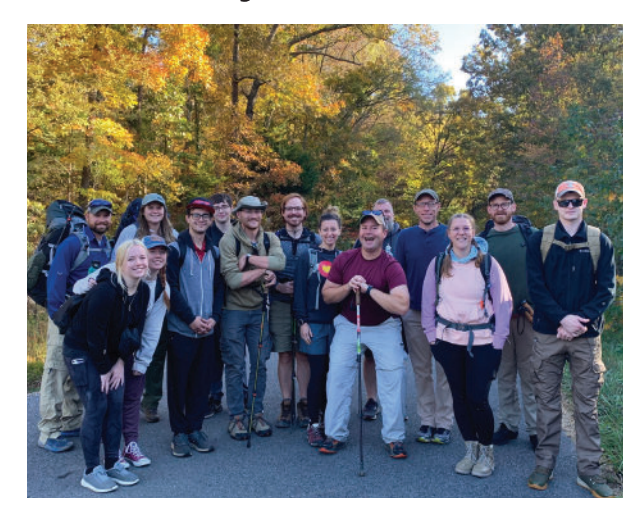
The participants of the Oct. 20-22, 2023 hike retreat for young adults in the Diocese of Owensboro.