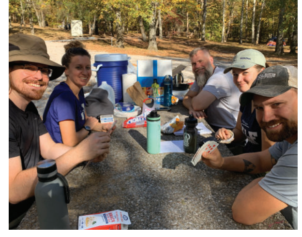
Hikers take a break during the Oct. 20-22, 2023 hike retreat for young adults in the Diocese of Owensboro.