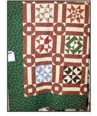
The quilts are made by Ursuline Sisters, Associates and friends.