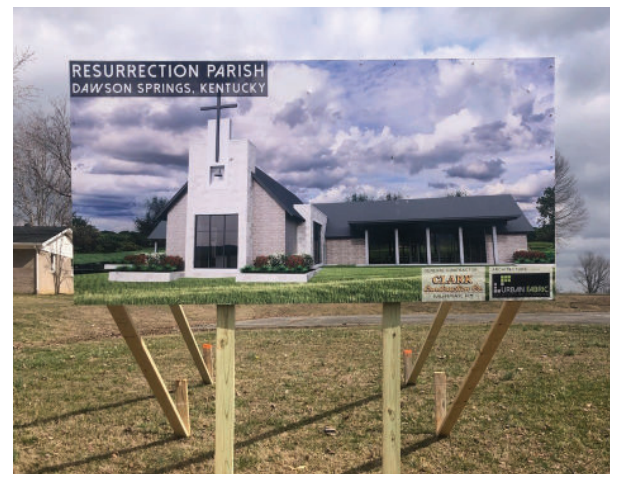
The sign on the property of Resurrection Parish in Dawson Springs.

"Go to that inner space and seek a peace that may be found in that place," he said. "Find that inner room, celebrate it, and thank God." ■