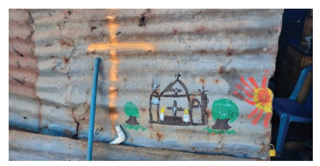
The wall painting by the family's six-year-old son that inspired the building crew.

People ask, why go out of America to work, when there is plenty of need here? But there are agencies in America to help the needy. In Guatemala, they don't have any of that. I was amazed how happy and content the family was. We in America are so caught up in all the stuff in our lives. They didn't have many necessities, but did not blame God for their misfortune. They praised and worshiped the same God we do; we are all Children of God. At the site I noticed a simple painting on a piece of tin, which was the family's original kitchen wall. The son had painted a cross and Church. The moment we saw this, we knew God meant us to be there in this village. That painting from that little boy inspired us. This family had the love of Christ in their hearts and hope