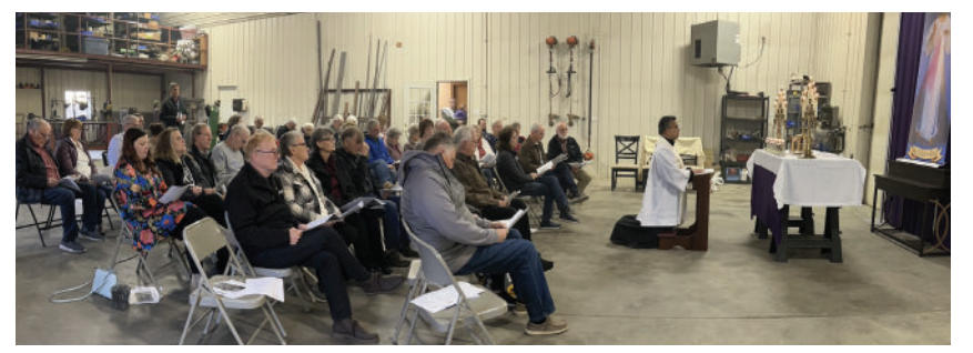
The crucifix is seen through the monstrance at St. Mary Magdalene Parish in Sorgho. On March 12, the parish held its first of three Eucharistic Listening Sessions.