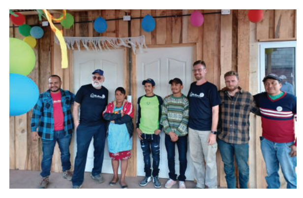
The Birdhouse Foundation crew that worked to build a new house for these homeowners in Guatemala in January 2023.

for the future. They told us our team from America was their hope. And as you go about your day, when you turn that faucet on, and the water flows freely, or when you go to bed tonight, you have a warm place to lay your head. Say a prayer of thanks to God for your blessings.