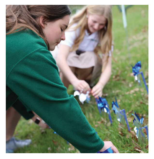
On March 13, SCRUBS members place blue pinwheels on the front lawn of Owensboro Catholic High School in recognition of upcoming Child Abuse Prevention Month, which takes place in April.