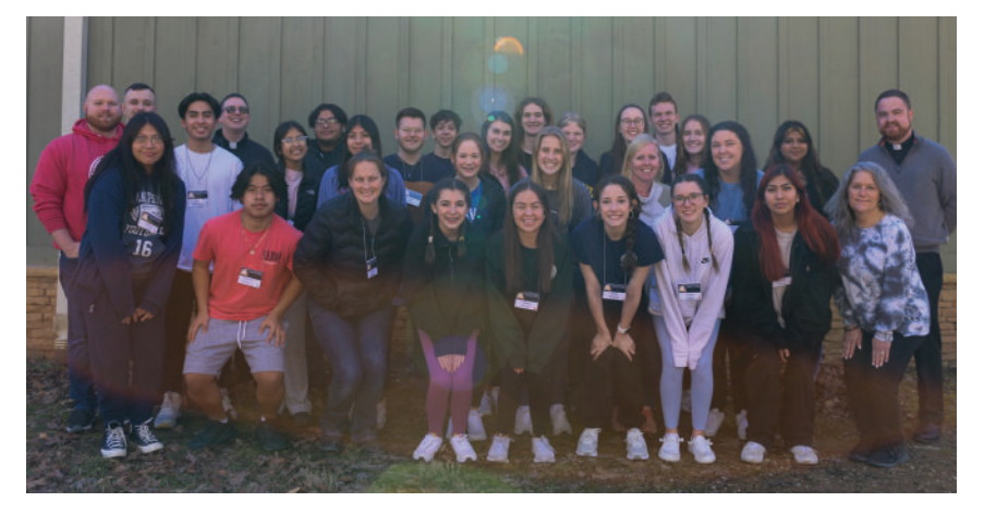
Lazarus Retreat #5 took place on Feb. 17-19, 2023 at Gasper River Catholic Youth Camp and Retreat Center.

Opportunities for youth to encounter Jesus Christ