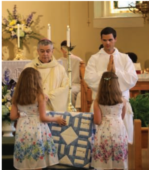
Girls carry a quilt, representing all the families of St. Lawrence Parish, up the aisle during the parish's bicentennial Mass and celebration on August 14, 2022.