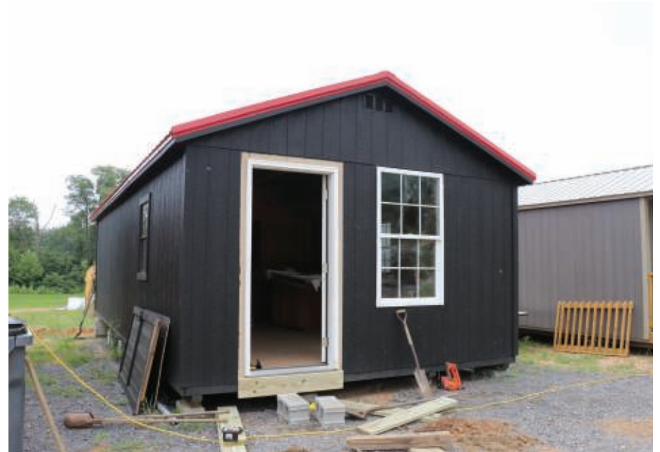
A tiny home in progress is seen at Camp G.R.A.V.E.S. in Graves County, Ky., on July 19, 2022.