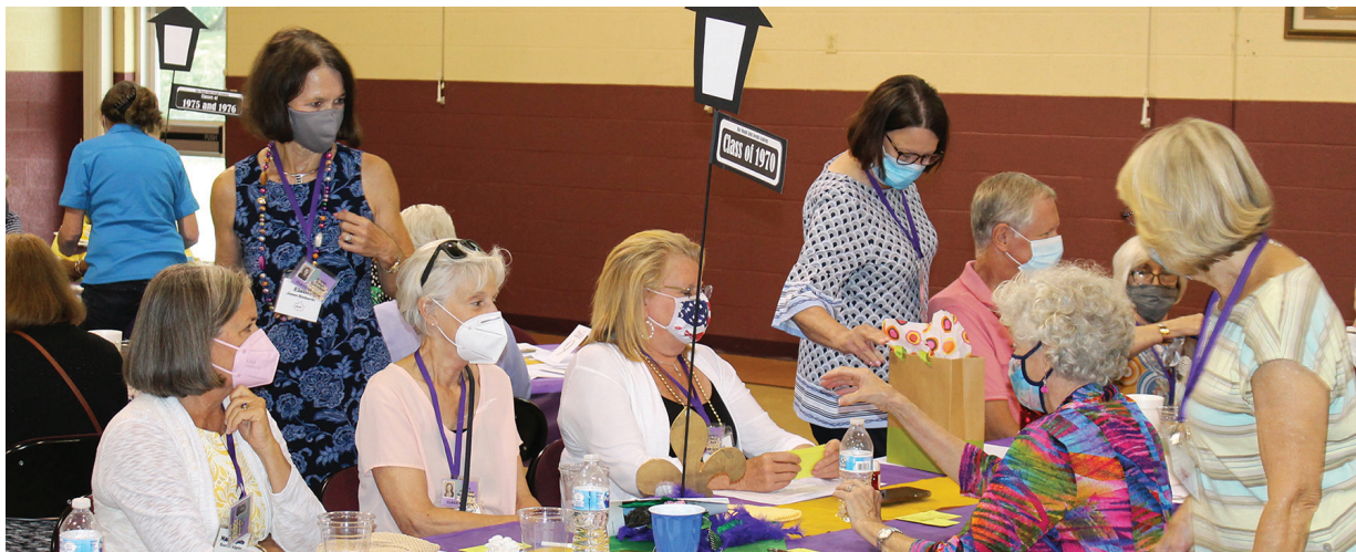
The fashion statement of the day at the Aug. 29 Mount Saint Joseph Academy Alumnae Weekend was a protective mask, but the class of 1970 was just happy they could finally celebrate their 50th reunion – a year late.