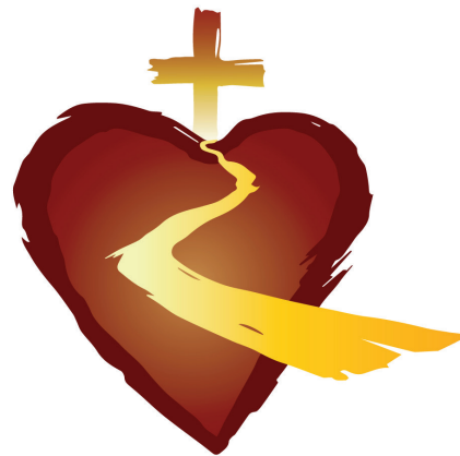
The logo for Life Giving Wounds.