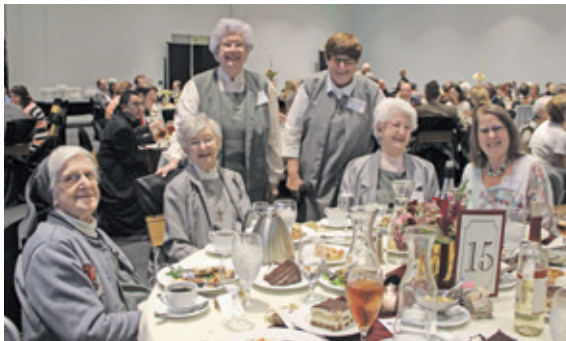
A group of Glenmary Sisters smile for a photo-op during dinner at VOCARE 2015.

VOCARE 2015 a success ... Continued from page 5