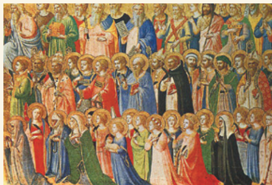
Todos los Santos, pintado por Fra Angelico.

Feliz temporada de otoño hermanos. Quizás nos queden algunas semanitas de buen sol y rico clima antes del frío, aprovechemos y disfrutemos al máximo esta bendición que nos viene de nuestro buen Padre Dios. También se acerca ya ese tiempo hermoso de fin de año con nuestras festividades llenas de colorido, tradición e historia entre ellas y para nosotros los hispanos/latinos, el -Día de Muertos y Día de Todos los Santos-. Aunque es cierto que vivimos en los Estados Unidos de América y respetamos las tradiciones del país y aprecia-