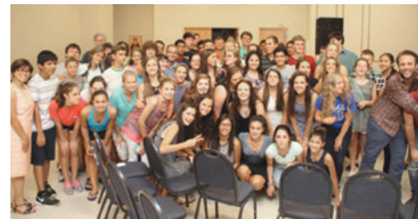
Celebración de la Juventud de Paducah en Santo Thomas More.

Ellos planean continuar construyendo puentes en su parroquia, porque han aprendido que aunque vengan de diferentes culturas, existe un lugar para cada uno de ellos en nuestra Iglesia y que la misión de Cristo es para todos. ♦