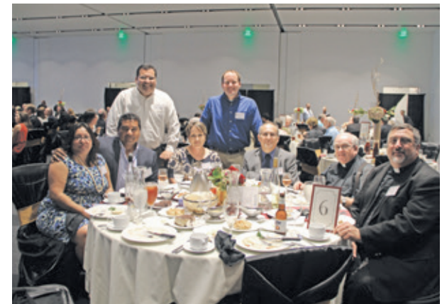
Los invitados de VOCARE de la Mesa 6 sonrían para una foto durante la cena.