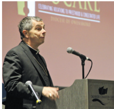
El Obispo Medley da una presentación a los 400+ invitados al segundo evento anual de VOCARE.