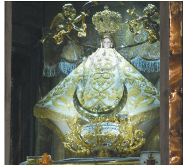
Pictured is the statue of Our Lady of San Juan in Jalisco, Mexico.

Simple peoples from Mexico to Brazil that journey on Marian pilgrimages have appointment to meet a wonderful, loving person and embrace her as their own Mother. Like St. Juan Diego that at that dramatic point during his encounters with Mary understood those words from Guadalupe: "Am I not here who am your Mother"? They are Catholics that in my experience offer clear witness that their whole life is a journey with Heav-