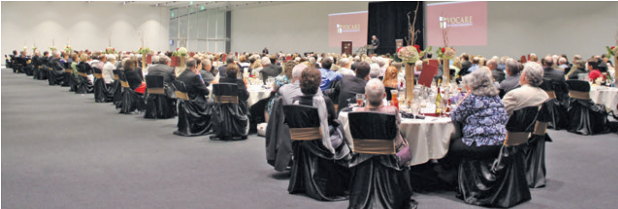
More than 400 guests attended this year's VOCARE event, a celebration of vocations to the priesthood and consecrated life in the Diocese of Owensboro.