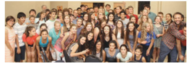
Paducah Youth Celebration at St. Thomas More Parish, Paducah.