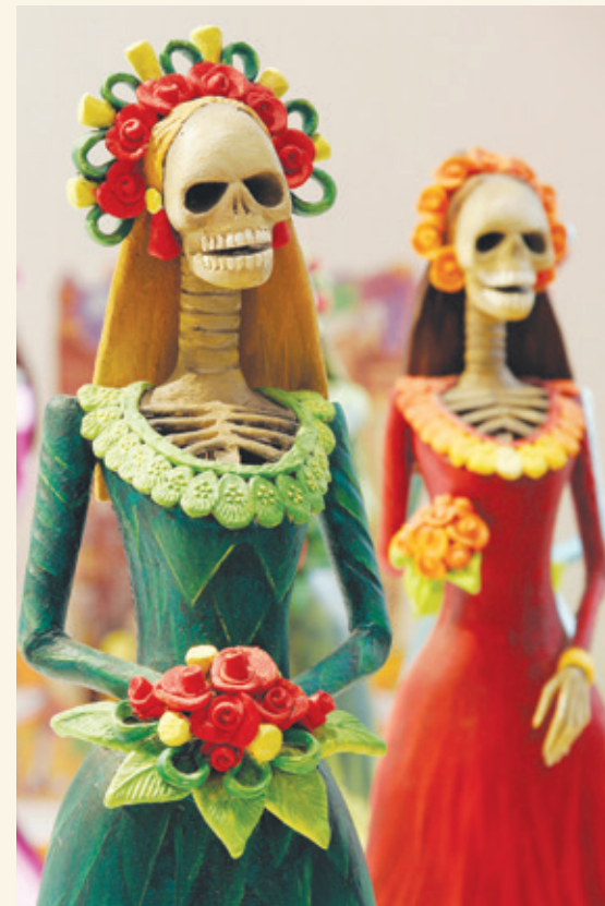
La Catrina. En la cultura popular mexicana, la Catarina, popularizada por José Guadalupe Posada consiste en el esqueleto de una mujer de la alta sociedad y constituye una de las figuras más populares en las celebraciones del Día de Muertos en México.

Que la distancia entre nuestros países de origen y donde nos encontramos ahora en los Estados Unidos no mermen el practicar nuestras tradiciones religiosas y culturales. Pidan y busquen espacio. Organicen una vigilia, recen un rosario en comunidad o júntense en alguna casa, construyan un altar de muertos, háblenle a sus hijos sobre los Santos y vístanlos de algún santo, visiten algún cementerio local etc... Y sobre todo, no se olviden de educar e inculcar esto en sus hijos y nietos. Nuestras tradiciones son una