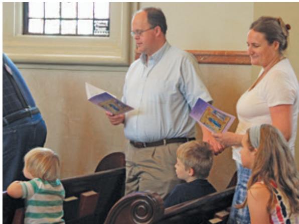
Rodeados por sus hijos, los padres se agarran de la mano mientras el Monseñor Medley los guía en la reafirmación de sus votos de matrimonio en la celebración el 20 de Sept.