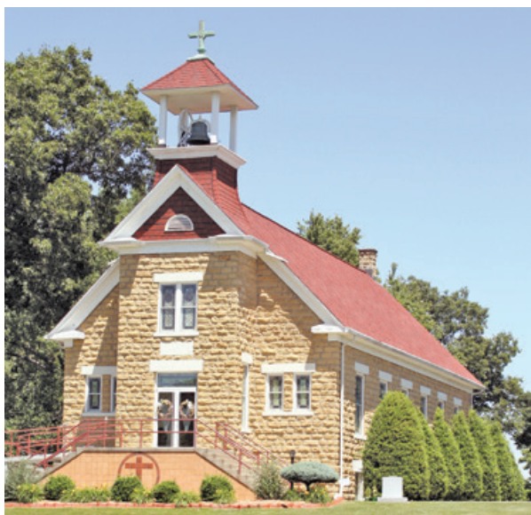
Above: St. Mary of the Woods Parish, McQuady; one of the six pilgrimage sites in the Diocese of Owensboro. Below: The exterior of the motherhouse chapel belonging to the Ursuline Sisters of Mount St. Joseph in Maple Mount.