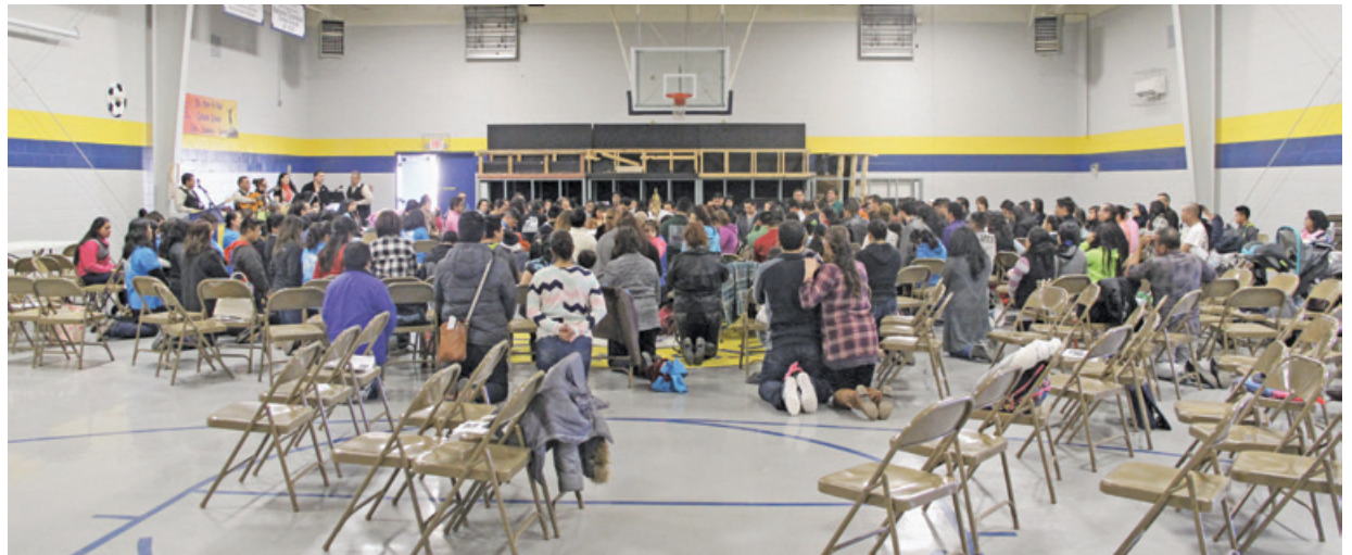
Families gather together to pray for one another during the adoration portion of the Encuentro.

Lunch was served to the more than 400 in attendance, who came from Beaver Dam, Bowling Green, Elkton, Henderson, Madisonville, Mayfield, Owensboro, Paducah, Russellville, and Sebree. The day concluded with confession and a vigil Mass. ♦