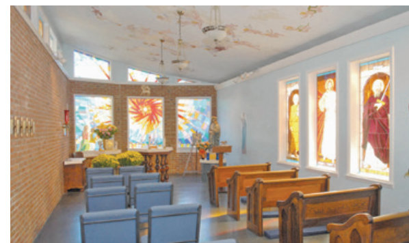
The interior of the Marian Shrine at St. Joseph Parish, Bowling Green.

Reconciliation at the Fathers of Mercy Chapel is Sunday from 9:15-10 a.m., and after every daily and Sunday Mass. Reconciliation is also available Mondays from 7-9 p.m. and Fridays from 3-5 p.m.