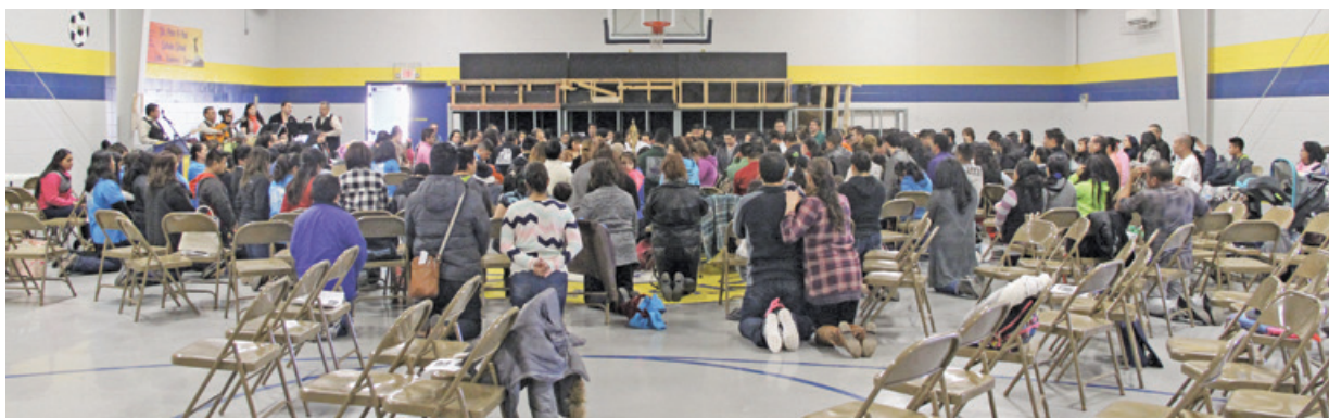
Las familias se juntan para rezar unas para otras durante esta parte del Encuentro.

Se sirvió el almuerzo a los más de 400 personas presentes, quienes llegaron de Beaver Dam, Bowling Green, Elkton, Henderson, Madisonville, Mayfield, Owensboro, Paducah, Russellville y Sebree. El día se concluyó con confesiones y una misa de vigilia. ♦