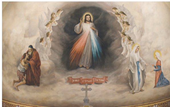
A detail from the ceiling of the Fathers of Mercy Chapel of Divine Mercy in Auburn. File photo.

There is perpetual adoration in the Chapel of Mercy. Reconciliation is available from 4-5 p.m. Saturday and 5:30-6 p.m. Thursday. On December 8, 2015 there was solemn sung vespers celebrating the opening of the Year of Mercy.