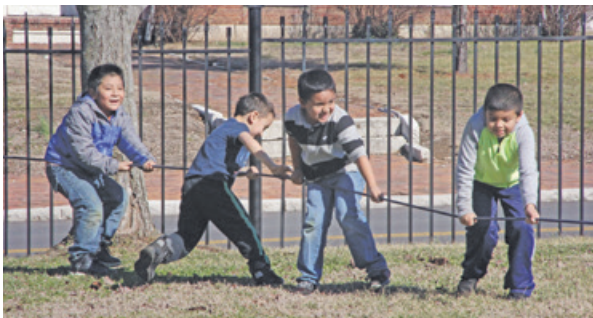
¡El juego de tirar de la cuerda fue un gran éxito con los niños!