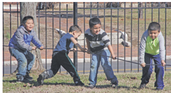
Tug-of-war is a huge hit with the children!