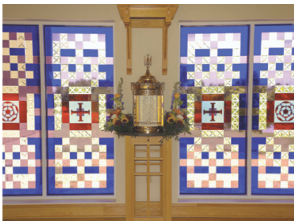
The tabernacle and stained glass windows inside the Chapel of Mercy at St. Thomas More Parish, Paducah.

There will be a special celebration for the Year of Mercy on June 3, 2016, the Solemnity of the Sacred Heart of Jesus.