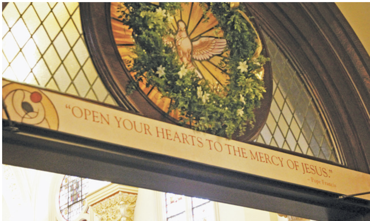
A detail from the Door of Mercy at St. Stephen Cathedral, Owensboro.

The cathedral's daily weekday Masses are 7 a.m. and 12:05 p.m. Eucharistic adoration is on first Fridays from 5:30-6:30 p.m. The Sacrament of Reconciliation is available on Saturdays from 9:30-11:30 a.m., as well as on the Thursdays before first Fridays, from 4-5 p.m.