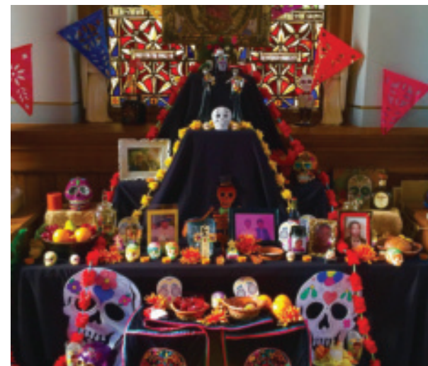
Several parishes in the Diocese of Owensboro set up altares de muertos each year during the two days (Nov. 1 and 2) celebrating Día de los Muertos. Pictured is the 2016 altar at Holy Name of Jesus Parish in Henderson.

He also said that when he was growing up, his mother would always place a candle, a glass of water and some food “for the soul who had no place to