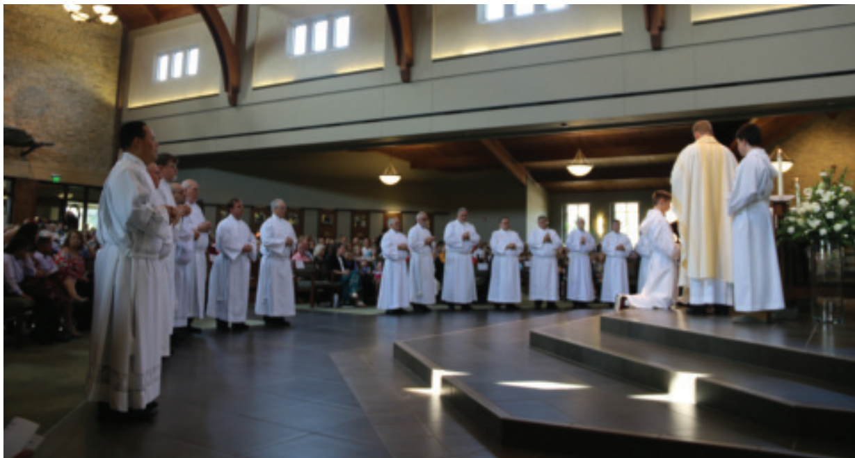
The 16 candidates stand before the bishop and publicly declare their intention to undertake the ministry of permanent deacon. They promise to fulfill their office with prayer and dedication, following the life of Christ.

Sixteen men ordained to permanent diaconate for Diocese of Owensboro on Sept. 16