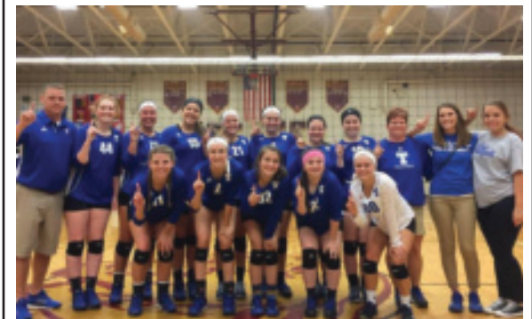
Trinity High School's Lady Raiders competed in the All "A" State Tournament in mid-September. The team finished the season as 3rd Region champions.