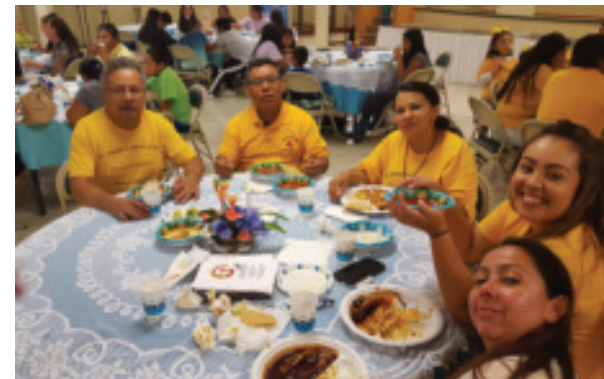
Members of St. Joseph Parish in Bowling Green enjoy the meal after the V Encuentro procession and Mass at St. Stephen Cathedral.