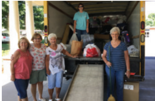
Members of the Precious Blood Conference at the July 15, 2017 Stuff the Truck activity at Precious Blood Parish.

After receiving the Friends of the Poor Grant from the National Council of the U.S. Society of St. Vincent de Paul (SVdP), an Owensboro-based SVdP conference will be able to serve even more people in the local community.