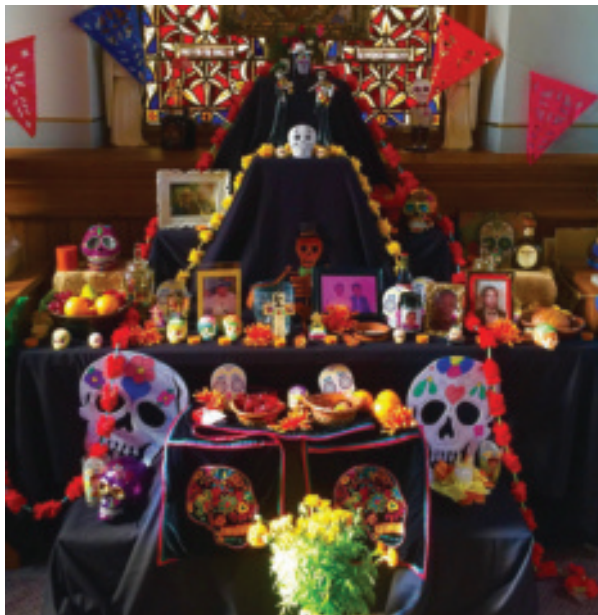
Varias parroquias en la Diócesis de Owensboro adornan altares de muertos cada año durante los dos días (Nov. 1 y 2) celebrando el Día de los Muertos.

POR ELIZABETH WONG BARNSTEAD, EL CATÓLICO DE KENTUCKY OCCIDENTAL