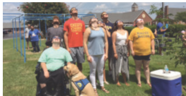
Murray State students wear safety glasses while viewing the Aug. 21, 2017, total solar eclipse.

istry for Murray State University is thriving and truly being blessed. Please visit our website to see all the things that we do: catholiccracers.org . ■