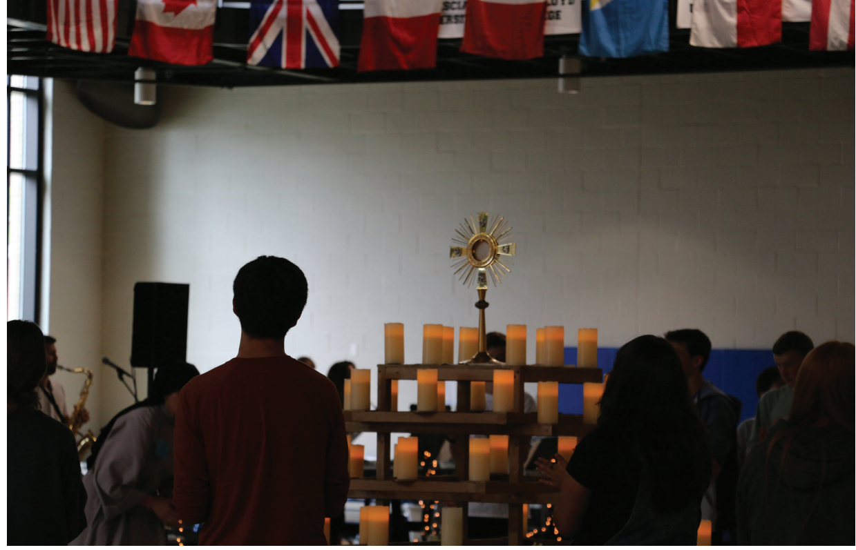
Young people participate in praise and worship in Adoration of the Blessed Sacrament in the afternoon of July 17, 2021, during Youth 2000 at Brescia University in Owensboro.