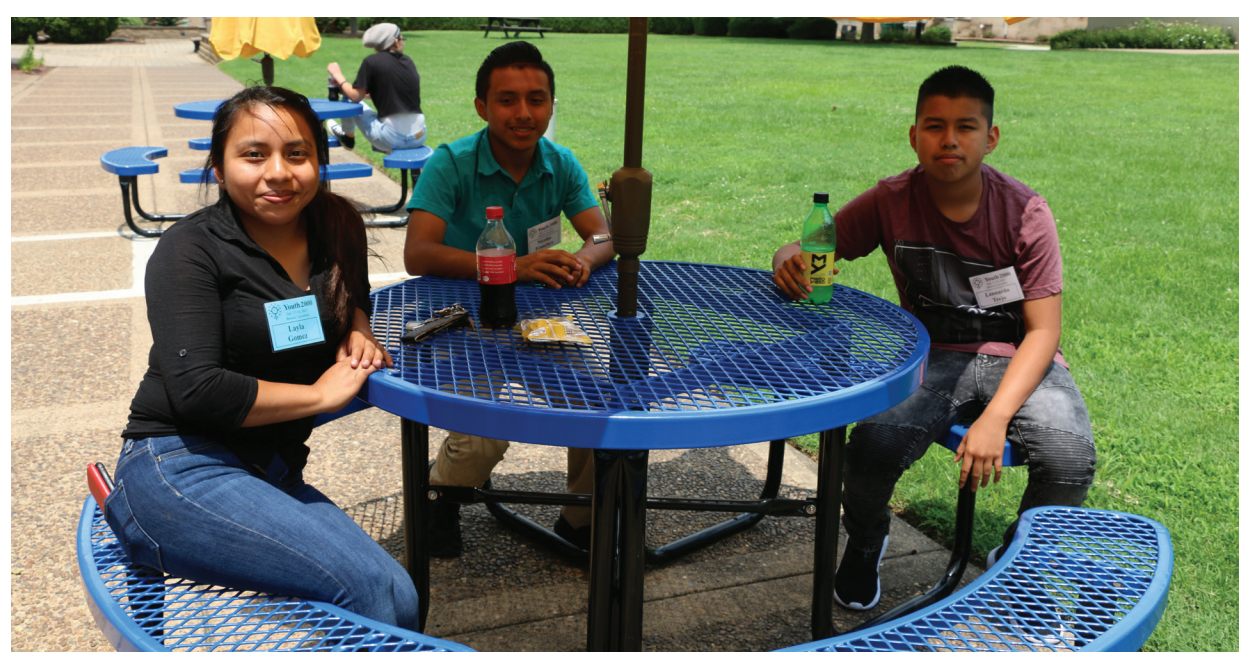
ELIZABETH WONG BARNSTEAD | WKC Varios adolescentes que participan en el retiro Youth 2000 [Juventud 2000] sonríen durante un descanso por la tarde el 17 de julio de 2021.

El 24° retiro anual Youth 2000 [Juventud 2000], tuvo lugar en la Universidad de Brescia en Owensboro. Youth 2000 generalmente se lleva a cabo en la primavera, pero se pospuso este año debido a la pandemia del COVID-19. Aproximadamente 70 jóvenes asistieron al retiro, que incluyó Misa, adoración, oportunidades para la Confesión y pláticas.