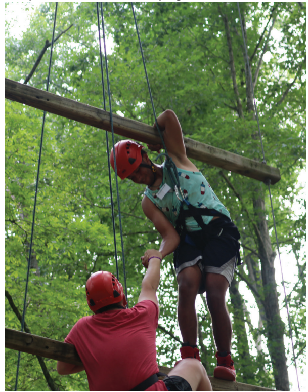
Campers help each other on Jacob's Ladder on July 8, 2021 during Camp LIFE at Gasper River Catholic Youth Camp and Retreat Center in Bowling Green.