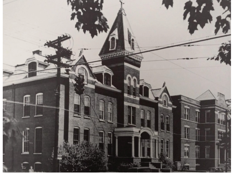
St. Frances Academy, the original name of Owensboro Catholic High School, is seen in this undated photograph.