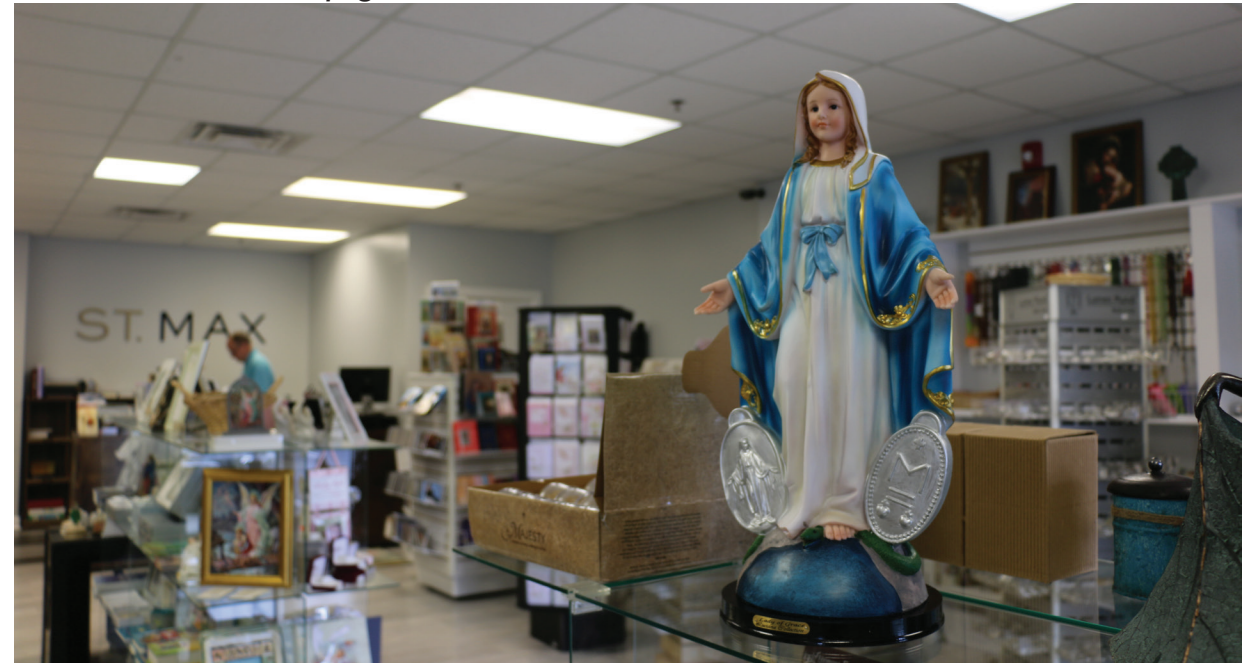
ELIZABETH WONG BARNSTEAD | WKC The interior of the new location of St. Maximilian Kolbe Books and Gifts on Halifax Drive.