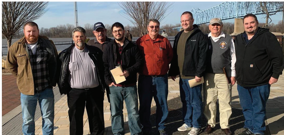
Knights of Columbus Council #2499 attend the Catholic Men's Conference of Western Kentucky on Feb. 15, 2020.