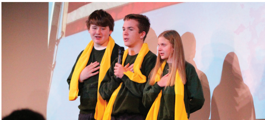
Students of Owensboro Catholic Schools recite the Pledge of Allegiance at the Jan. 31, 2020 Western Kentucky National School Choice Week Rally, held at the Bluegrass Music Hall of Fame & Museum in Owensboro.