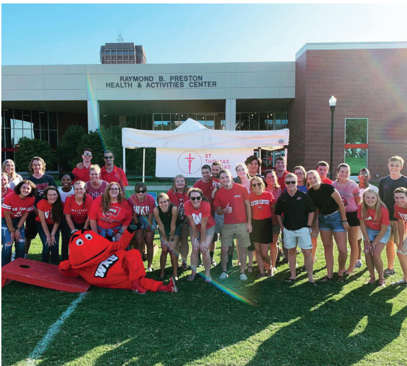
St. Thomas Aquinas Newman Center students at a Sept. 5, 2019 football tailgate with Big Red, the mascot of Western Kentucky University in Bowling Green.