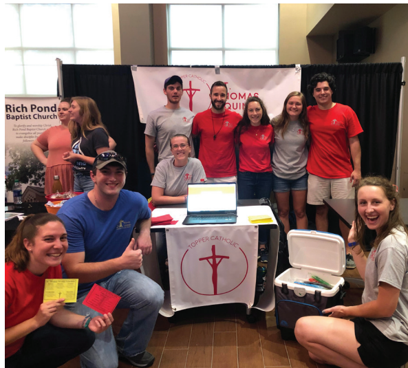
FOCUS missionaries and students oversee the St. Thomas Aquinas table during a campus ministries lawn party.

BY THE WKU NEWMAN CENTER LEADERSHIP TEAM, SPECIAL TO THE WESTERN KENTUCKY CATHOLIC