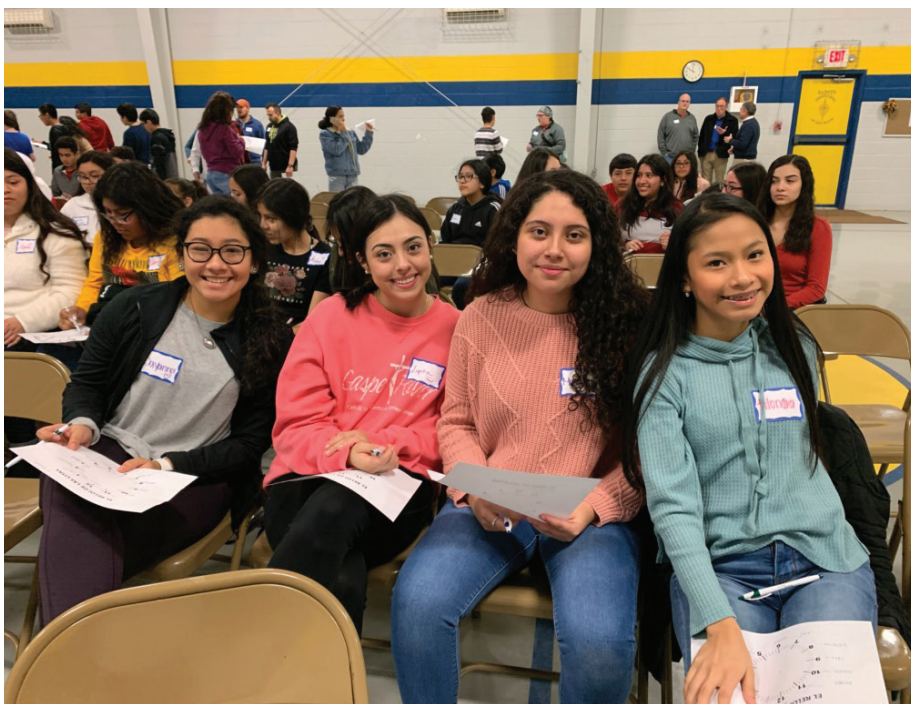
Several young women participate in the youth retreat of Encuentro on Jan. 25, 2020, led by the diocese's Office of Youth and Young Adult Ministry.