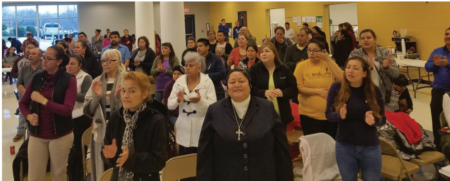
People sing and pray during Encuentro on Jan. 25, 2020, held at Sts. Peter and Paul Parish in Hopkinsville.